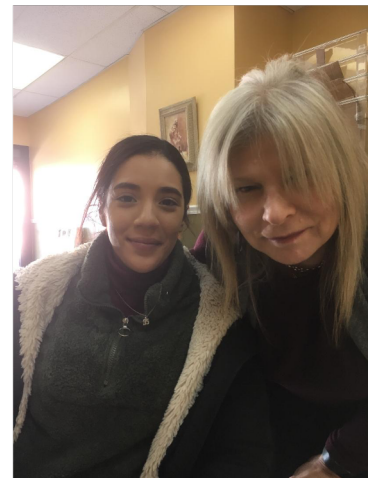
One of our young ladies from Doula Class

Through the Doula Classes we are having In Coney Island we are helping women with no family support.